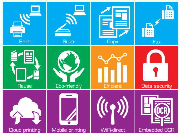
Toshiba's Hybrid MFP - all features you need in one unique system.